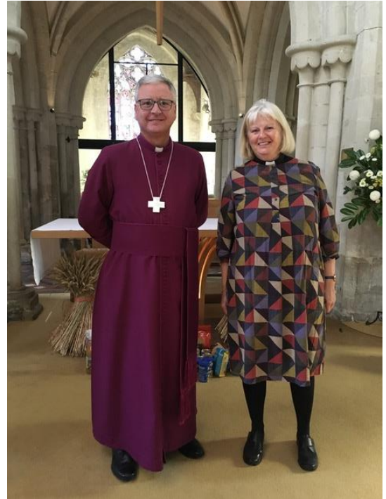
With the Bishop of Salisbury after last Sunday's service