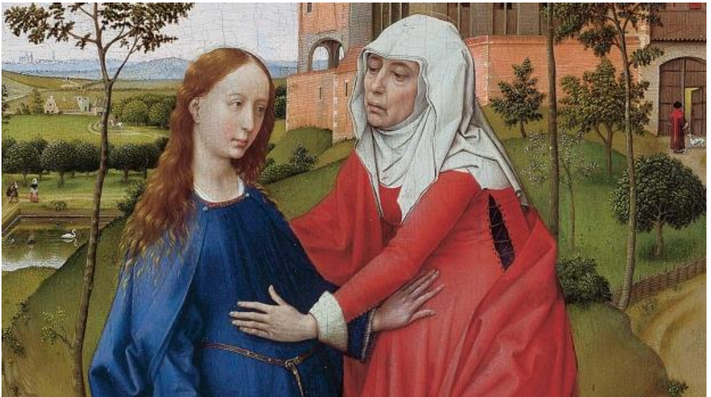
Visitation (c 1445) Rogier van der Weyden Oil on panel Museum der bildenden Künste, Leipzig

In those days Mary set out and went with haste to a Judean town in the hill country, where she entered the house of Zechariah and greeted Elizabeth. When Elizabeth heard Mary's greeting, the child leaped in her womb. And Elizabeth was filled with the Holy Spirit and exclaimed with a loud cry, "Blessed are you among women, and blessed is the fruit of your womb. And why has this happened to me, that the mother of my Lord comes to me? For as soon as I heard the sound of your greeting, the child in my womb leaped for joy. And blessed is she who believed that there would be a fulfilment of what was spoken to her by the Lord."