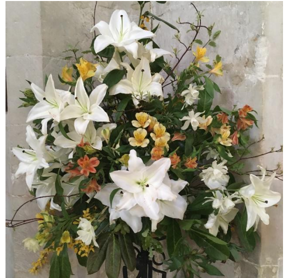
Easter flowers in St John's Church