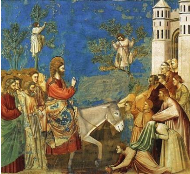
Fresco by Giotto (c 1305) Scrovegni Chapel, Padua

This is the second successive year in which we have not been able to join together for our traditional re-enactment of Palm Sunday and the triumphal entry into Jerusalem. For a second time, we are not able to process down (or up) the High Street behind the donkey, singing hymns and praising God. We are not able to witness corporately and publicly to our faith in our Lord, who gave his life to save us from sin. In 2019, we joined with fellow Christians from the other Tisbury churches and witnessed not only to Christ but also to our unity in following him.