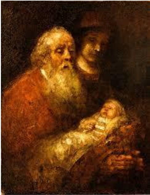
Rembrandt van Rijn Simeon with the Infant Christ Child in the Temple , 1669 Nationalmuseum, Stockholm

Today we are celebrating the Feast of the Presentation of Christ in the Temple, also known as Candlemas. The significance of candles as a celebration at this service was brought to me vividly when I was living in Wells, Somerset and working as school chaplain to the Cathedral School. We would all gather in the beautiful nave of the cathedral, in darkness, holding candles that would be lit and blessed. The choristers would lead then us in this candlelit procession to the Quire singing the Nunc Dimittis, the words of Simeon, commemorating Christ's entrance to the Temple. Here we would continue the service with the Eucharist. In this painting by Rembrandt, we see an image of Simeon as an old man, witnessing the Christ child with awe and reverence. This is the child he and Anna, the widow, have been awaiting with longing for the redemption of Israel. We too know something of longing and hope for better days.