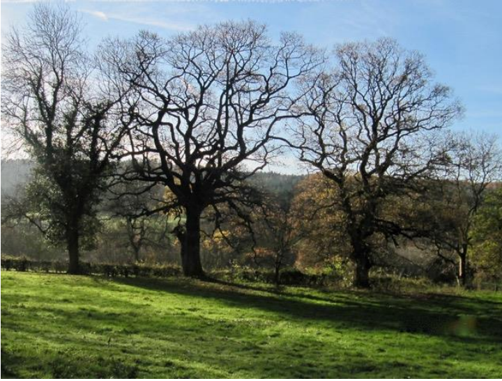
November Trees, Tymawr Convent, Monmouthshire