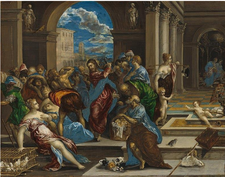
El Greco: Christ driving the Money Changers from the Temple (1568) National Gallery of Art, Washington DC

The dramatic incident of Christ driving the money changers from the Temple (the Cleansing of the Temple) is recounted in all four Gospels. In the synoptics, it takes place towards the end of Jesus' life, after the final entry into Jerusalem prior to his arrest, crucifixion and resurrection. John, however, places it early in his Gospel, not long after the start of Jesus' ministry. The timing of the incident is not of great importance; far more significant is Jesus' anger at the misuse of his Father's house, and his burning need to cleanse it of dishonest dealing and exploitation of the poor.